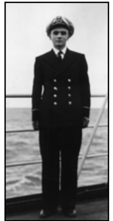
First trip to sea was on the M.S. Patani 1957 aged 21

13. Surprises are not really much in my life, but I suppose that when I became 21 in 1957, Army conscription was still on then, I had just finished my apprenticeship and my last wage slip was £5. I did not fancy going into the army at something like 27 shillings a week, so I joined the Merchant Navy with Elder Dempster Line and later Blue Star Line.