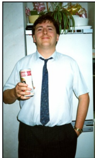
That often seen smile of satisfaction