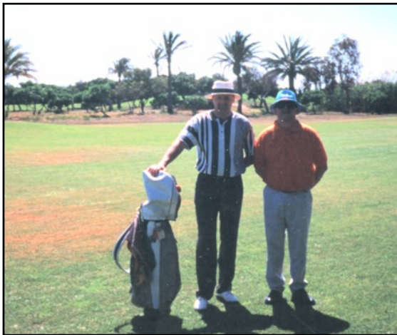
My partner doesn't play t/t, it was a course in Almeria having a well earned break