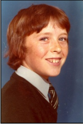
1972 - move up to the 'big school'