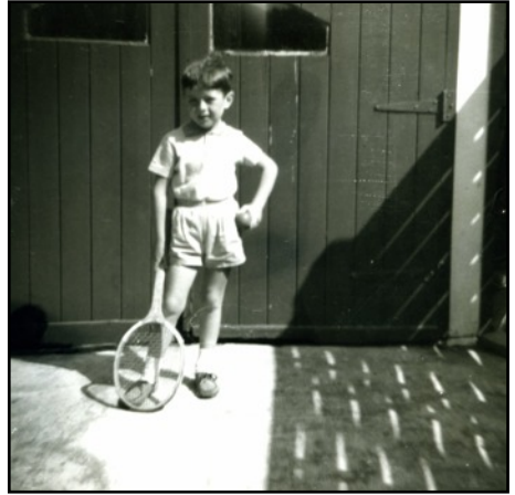
The garage, but not the bat, didn't have enough room, so converted to the little bat!