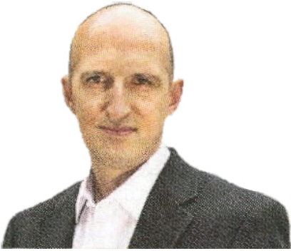
Matthew Syed – Sports Columnist and Feature Writer of the year Article first in The Times of Wednesday February 4th 2015

The notion of volunteering often sounds twee. The Unsung Hero award at the BBC Sports Personality