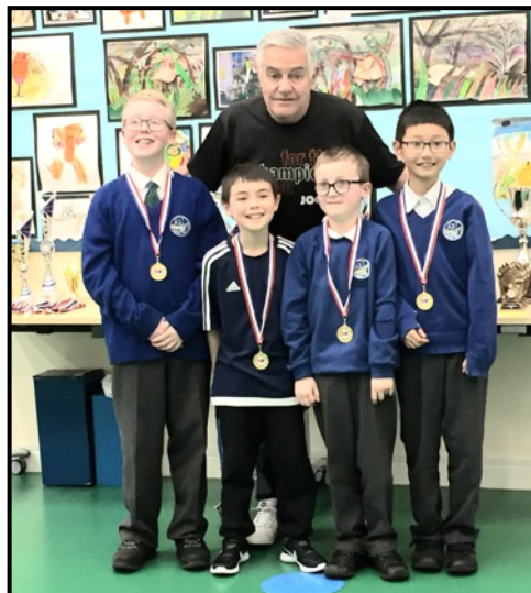
JDD 2017 presentation night at St. Johns