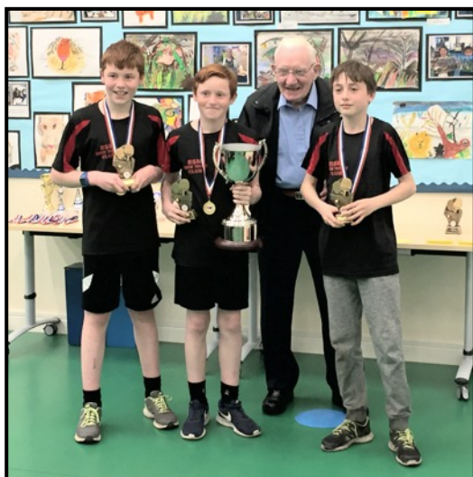
Two of the O/13 & U/13 teams at the