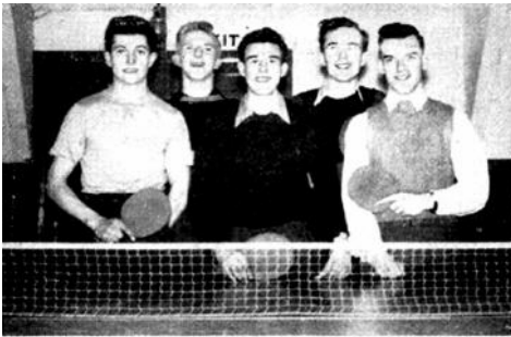
Undefeated Champions of the Liverpool and District Circa 1956-57 Table Tennis League (Div. 2.)