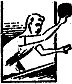
Table Tennis DIGEST

LIVERPOOL & DISTRICT TABLE TENNIS LEAGUE