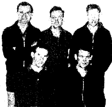
Can you put names to the faces of these youngster? Answers on foot of page 18