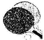
TABLE EDGES, NETS & ECHOES OF THE PAST