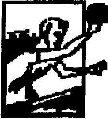
Table Tennis DIGEST