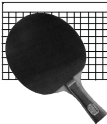
TABLE DIGEST TENNIS