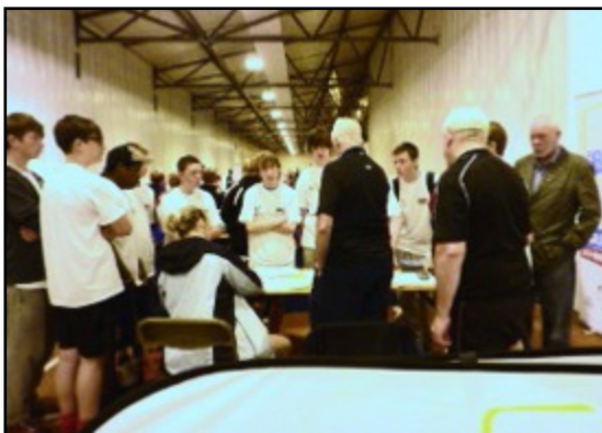
The volunteers get their instructions