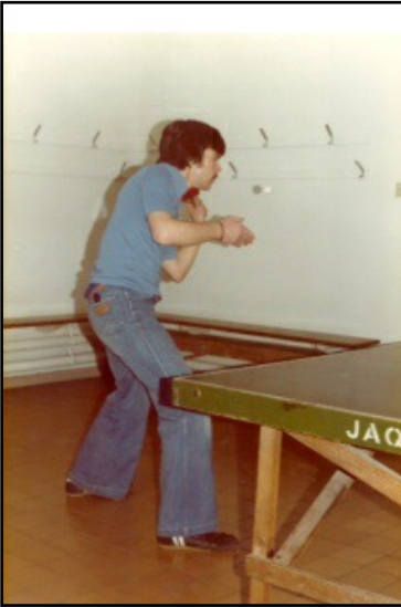
More Practice at Aigburth