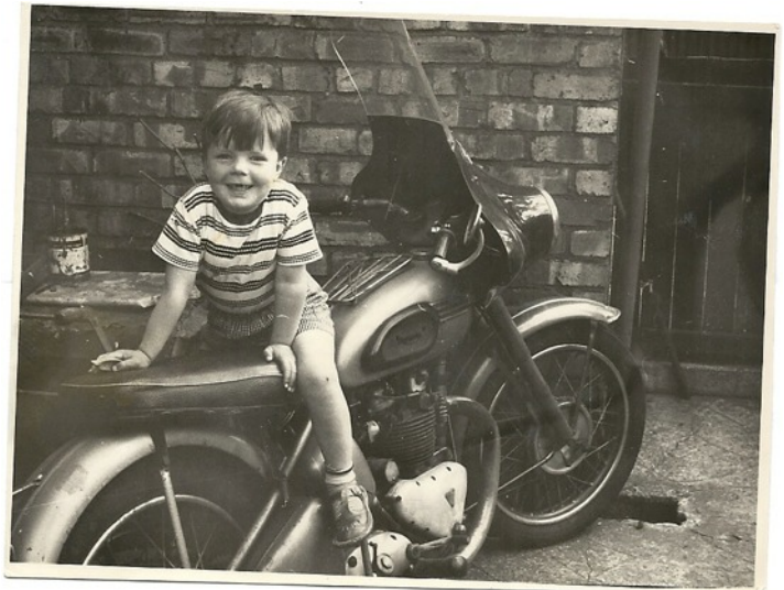
Dad's motorbike, not sure if it was a Triumph or Norton, a star of the day